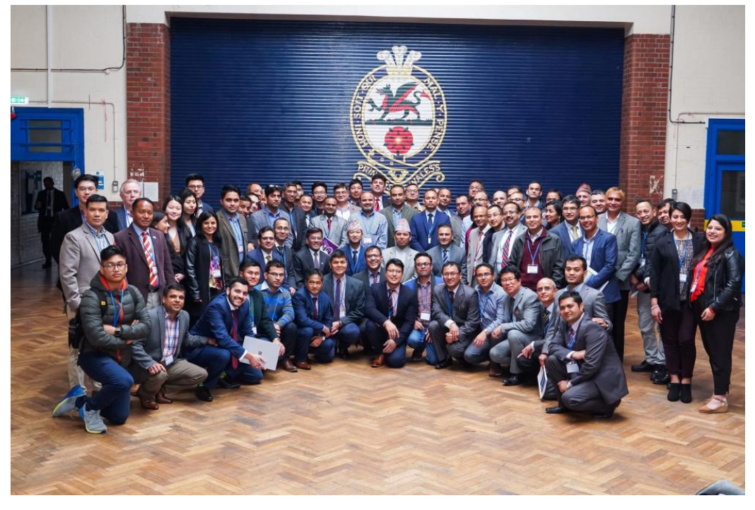
Visit to Institutions of Civil Engineers (ICE)